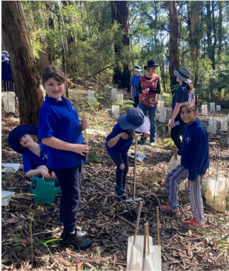
Forrest School students lending a hand

Forrest Primary School children planted out another 114 native plants on the Hennigan Crescent bush rehabilitation site one sunny morning in September. It was great to see the enthusiasm with which they took to the task, guided by Gerangamete and Forrest Landcare members and school staff. The site was absolutely buzzing with activity!