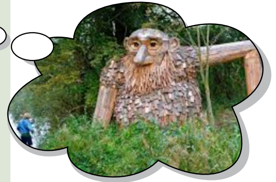
Image is an example of public art www.giantsofmandurah.com.au