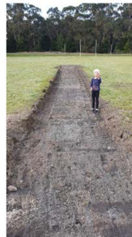
Above: The old pitch (left) and construction of the new pitch (right) – come see the finished product for yourself!