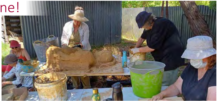
Some Studio Forrest participants working on the group piece 'Oblivia Sleeps', on show at the Lorne Sculpture Biennale - 1-30 March

Studio Forrest submitted an expression of interest for a project that would be their most ambitious yet! The group articulated their aim to establish a visceral connection to place, with each artist evoking their conception of the 'earth mother'—an eternally fruitful and powerful feminine source that generates and nurtures life—imploing us to connect and care for our earth.