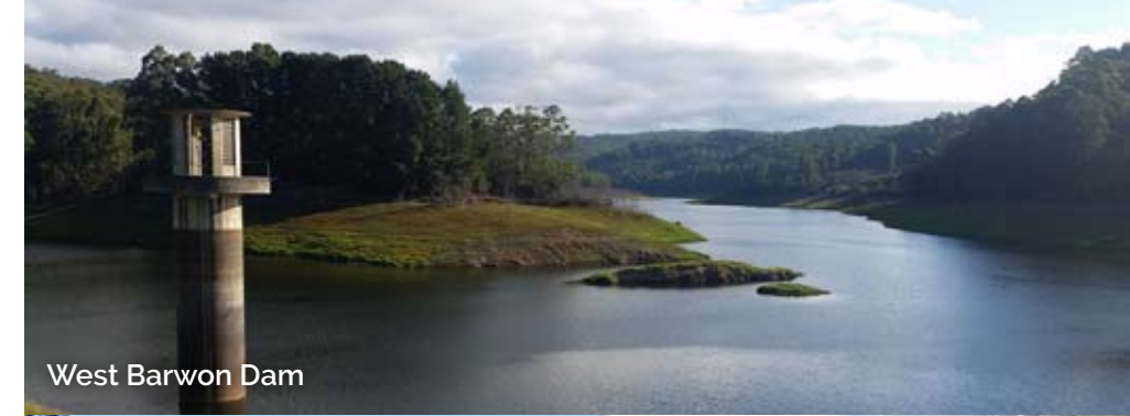
West Barwon Dam