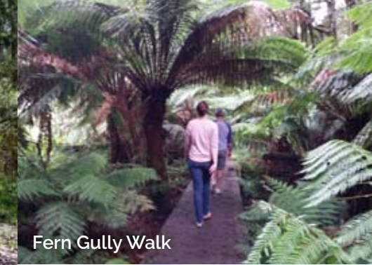
Fern Gully Walk